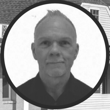
Whiting Resident Since 1988