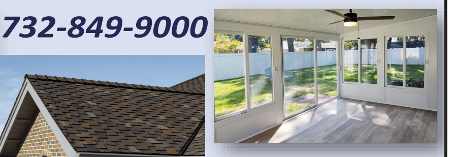
SUNROOMS SCREEN PATIOS