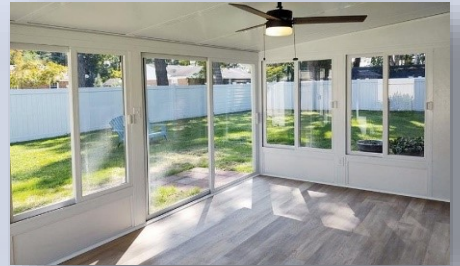
SUNROOMS & SCREEN PATIOS