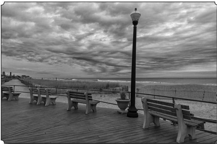
Ocean Grove boardwalk cloudy day.