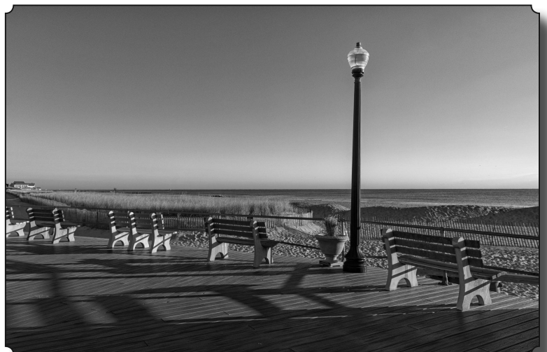
Ocean Grove boardwalk sunny day.