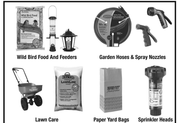
Wild Bird Food And Feeders

SENIOR PUBLISHING COMPANY accepts advertisements and advertisements are based upon information provided by the advertiser. SENIOR PUBLISHING COMPANY does not independently investigate the accuracy of advertisement content and does not warrant or represent the accuracy of the content of any advertisement.